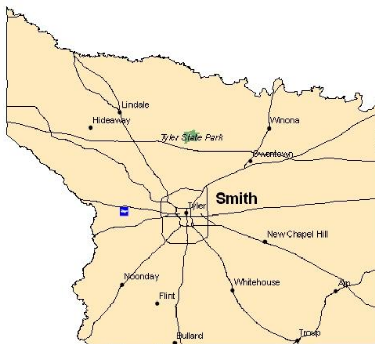
Figure 1. Tyler, Texas MSA

The local economic benefits generated by this level of home construction activity are reported in a separate NAHB document. 1 This report presents estimates of the costs—including current and capital expenses—that new homes impose on jurisdictions in the area and compares those costs to the revenue generated. The results are intended to answer the question of whether or not, from the standpoint of local governments in the area, residential development pays for itself.