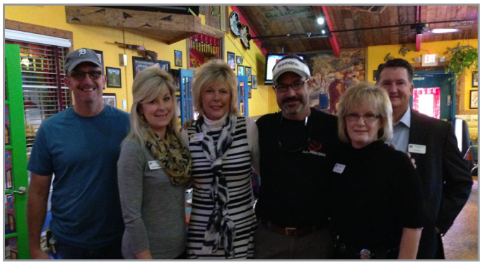
Thursday, November 6 Sponsor: Citizens National Bank