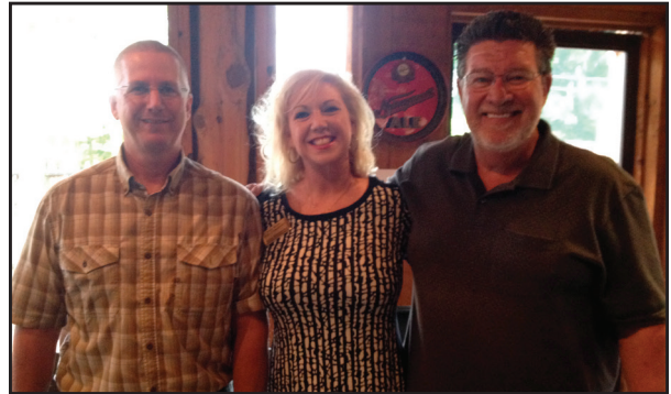
Thursday, May 8 Sponsor: East Texas Title Companies