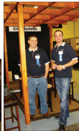
Exhibits, Seminars and Prizes, oh MY! — The public had a large number and variety of vendors to explore as well as opportunities to win door prizes. Below, seminars were standing room only!