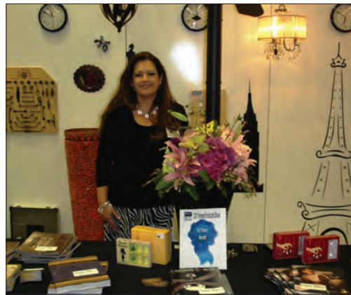
Feb. 25-27, 2011 — Winners of the best all-around booth competition were 1 st Place Fixture This (above), 2 nd Place Ace Fence (above right) and 3 rd Place Insurance One Agency (below). Congratulations to all the exhibitors on a great presentation!