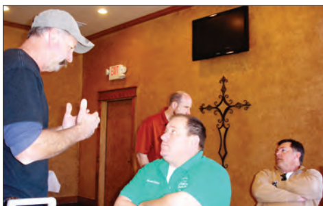
Bruno’s in Gresham. Thank you, sponsors!