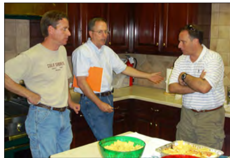
July 7, 2009 — Light Your Fire sponsored the After Hours and turned up the heat with barbecue!