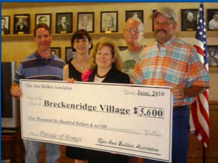
Parade Media Coverage Wrap-Up —Photographers from Tyler Today and BScene magazines along with a KLTV photojournalist documented the check presentation.