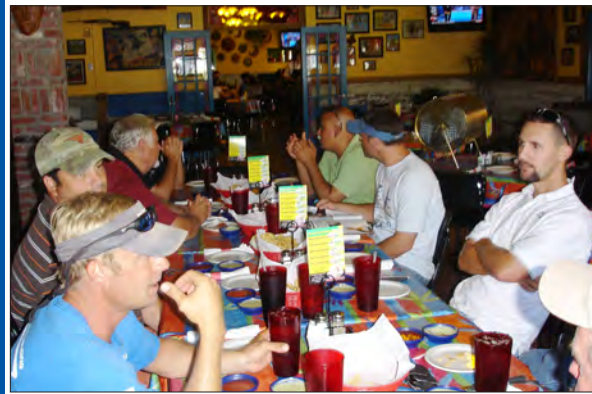
June 21, 2010-Parade Thank-You Luncheon —Builders discuss a successful Parade at Jalapeno Tree restaurant.