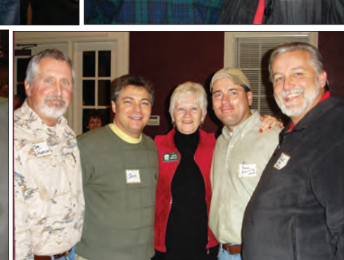
See all the photos at TABA's web site!