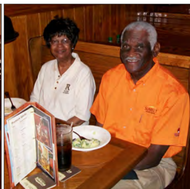
OUTBACK STEAKHOUSE—Builders enjoyed a luncheon sponsored by ProBuild South on Thursday, June 3 rd .