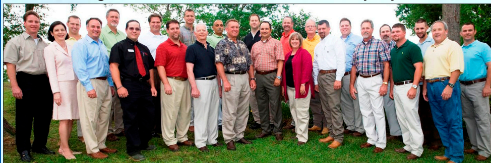
2009 Parade Builders

Benefiting St. Paul Children's Foundation & Azleway Boys' Ranch