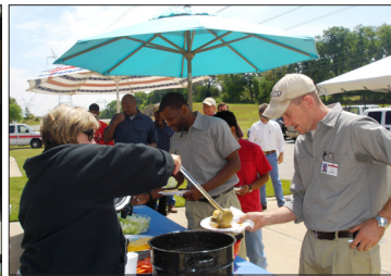
Everyone had a great time!