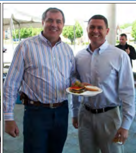
A cold wind did not dampen the appetites of the nearly 200 members who came out to enjoy the Member Appreciation Cookout on April 8 th . More photos online.