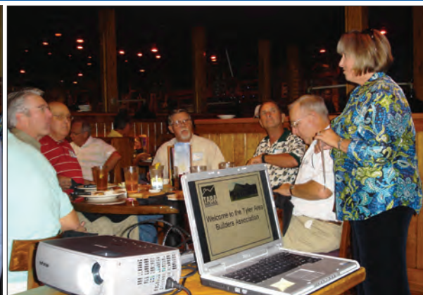
August 26, 2009—About 20 met for TABA's annual Past Presidents' Luncheon at Outback Steakhouse. Guests were treated to a slide show about the association that is used at TABA's quarterly New Member Orientations. More photos of the event are posted online at www.tylerareabuilders.com.