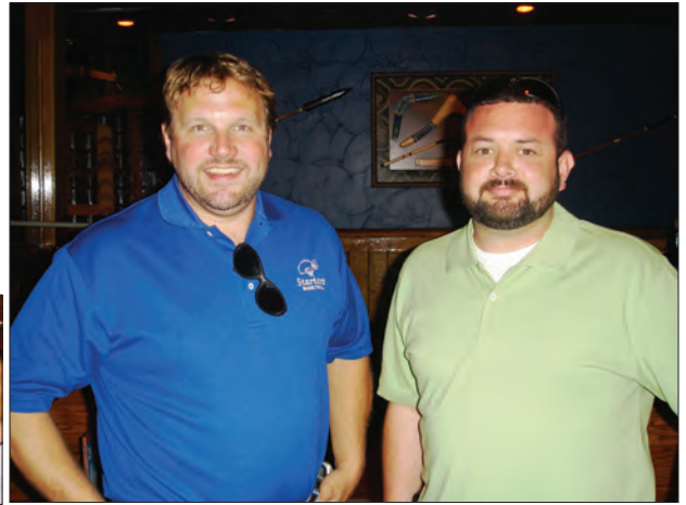
July 23, 2009—Builders met at Outback Steakhouse to enjoy a lunch courtesy of sponsor Leo Jones Insulating Co., Inc. To see what dates are open to host a Builders' Luncheon, sponsors should call the TABA office at 903-561-3964. More photos online at TABA's web site.