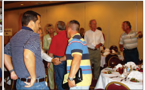
For Your Enjoyment—More photos of TABA events are posted at www.tylerearebuilders.com . At the bottom of any page, click on the Members Only link. Links to photo pages are posted on the left.