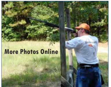
More Photos Online

SOUTHSIDE BANK Home Loans www.southside.com