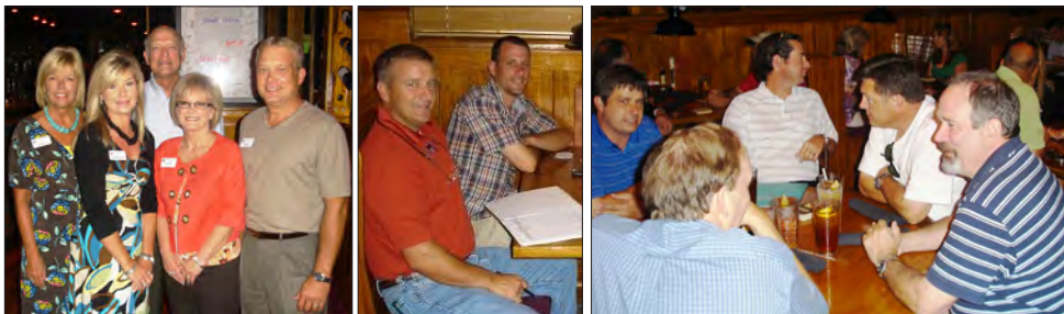
A big thank-you to everyone at Citizens National Bank, sponsors of the August 12 th Builders' Luncheon at Outback Steakhouse. To see all the photos, go to the Members Only page at www.tylerearebuilders.com .