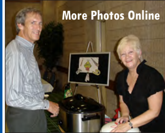
More Photos Online