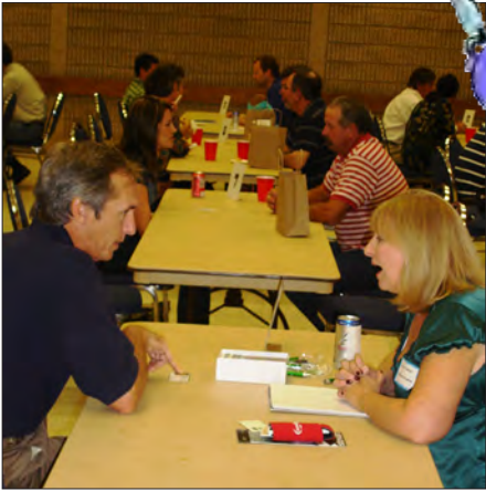
Speed Networking 2009

Like Speed Dating, only BUSINESS + FUN for all! A great way to network, promote your business and have fun! Only 20 Associates and 20 Builders will get to share the fun at the Rose Garden Center. Cost is $300 which includes a $50 builder gift. Download the Commitment Form from the Other Events page at TABA's web site.