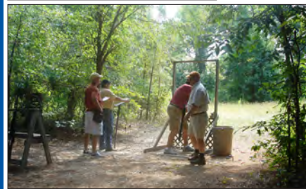
Suddenlink and Boren Scott Title Company, and to Cassity Jones for providing eye and ear protection and to Tyler Golf Carts for loaning us some wheels.