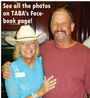
See all the photos on TABA's Facebook page!