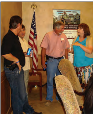
Many thanks to our August After Hours sponsor, James Hardie Building Products! A big crowd attended the Aug. 2 nd event.