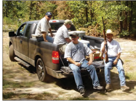
The second annual Sporting Clay Shoot on Aug. 12 was a huge success! Everyone had a great time in spite of the heat, and we will reach our HOME PAC contribution goal! See all the photos on TABA's web site.